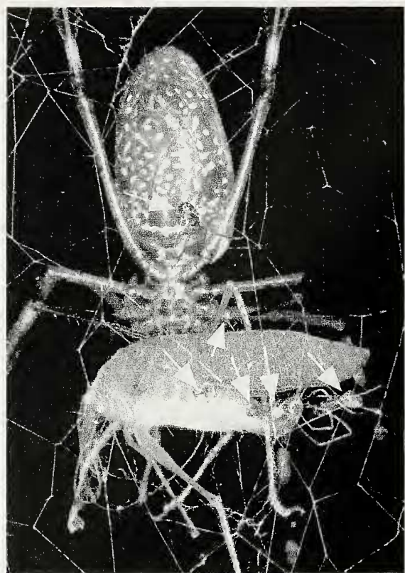
Figure 1.—Communal feeding of several individuals (arrows) of two Argyroides species with their host, Nephila clavipes .

may even feed together (Fig. 1, see also Robinson & Robinson 1973). As in sociality, such gregariousness and communal feeding must require diminished agonism.